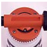
Multi-Ratio Dial has 5 Mixing Settings and Off

Anti-siphon - Protects water supply. (Note: a slight discharge of water from base of handle when water is turned off is normal and indicates anti-siphon is functioning properly.)